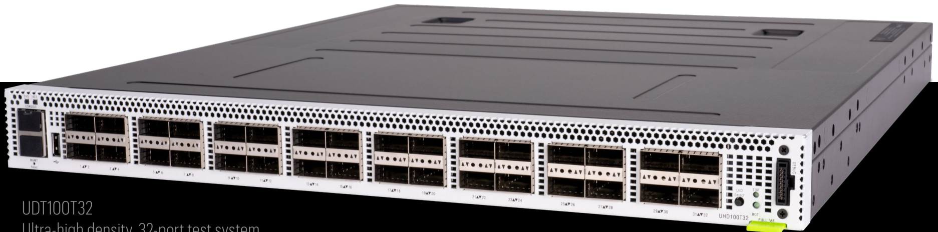
UHD100T32 Ultra-high density, 32-port test system